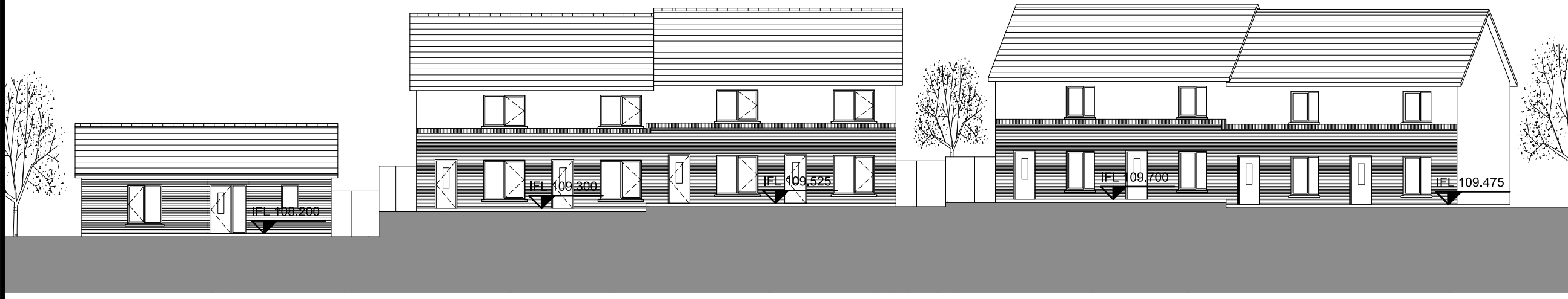
CONTEXTUAL ELEVATION 1-1 SCALE 1:100