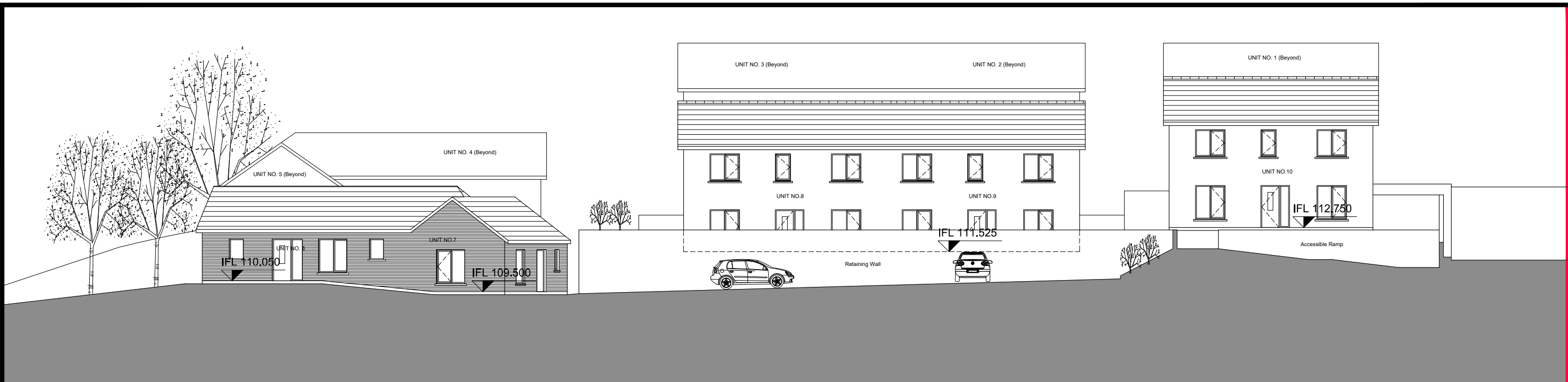
CONTEXTUAL ELEVATION 2-2 SCALE 1:100