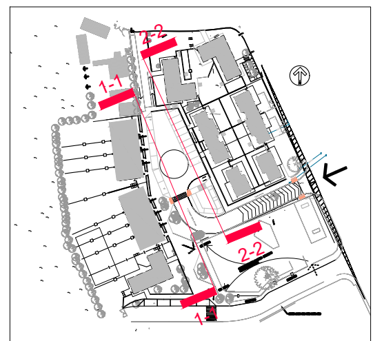
Key Plan SCALE 1:1000